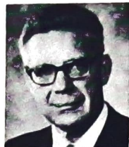
BRUCE R. McCONKIE of the Quorum of the Twelve Apostles of the Mormon Church

History of the Church , Volume 5, pages 218-219