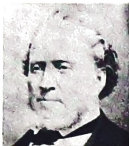
BRIGHAM YOUNG Second Prophet and President of the Mormon Church

May true Christians beware of all such hypocrisy!