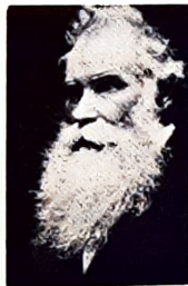
ORSON PRATT of the Quorum of the Twelve Apostles of the Mormon Church

Journal of Discourses , Volume 23, page 336