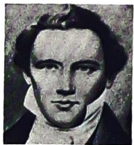
JOSEPH SMITH First Prophet and President and Founder of the Mormon Church

Journal of Discourses , Volume 10, page 110