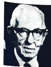
JOSEPH FIELDING SMITH Tenth Prophet and President of the Mormon Church

"I would not want you to believe that we bear any animosity toward the Negro. 'Darkies' are wonderful people, and they have their place in our church."