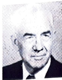
MARK E. PETERSON of the Quorum of the Twelve Apostles of the Mormon Church

"Who placed the Negroes originally in darkest Africa? Was it some man, or was it God? And when He placed them there, He segregated them. . . . The Lord segregated the people both as to blood and place of residence. At least in the cases of the Lamanites and the negroes we have the definite word of the Lord Himself that He placed a dark skin upon them as a curse—as a punishment and as a sign to all others. He forbade intermarriage with them under threat of extension of the curse. . . . And He certainly segregated the descendants of Cain when He cursed the Negro as to the Priesthood, and drew an absolute line. You may even say He dropped an Iron curtain there. The Negro was cursed as to the Priesthood, and therefore, was cursed as to the blessings of the Priesthood. Certainly God made a segregation there.